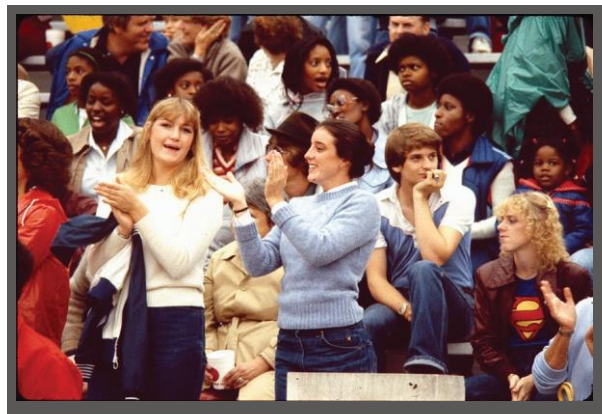
Southeast Missouri State University students.