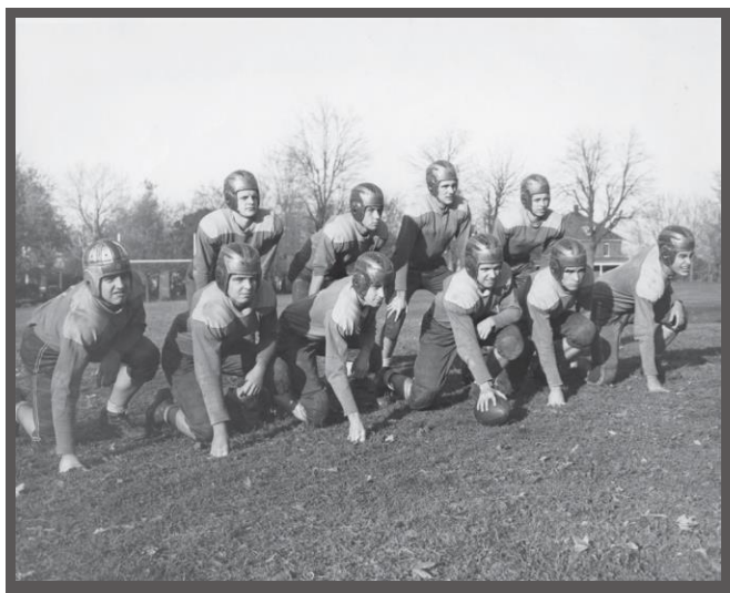
Southeast Missouri State Teacher's College football players, 1934.