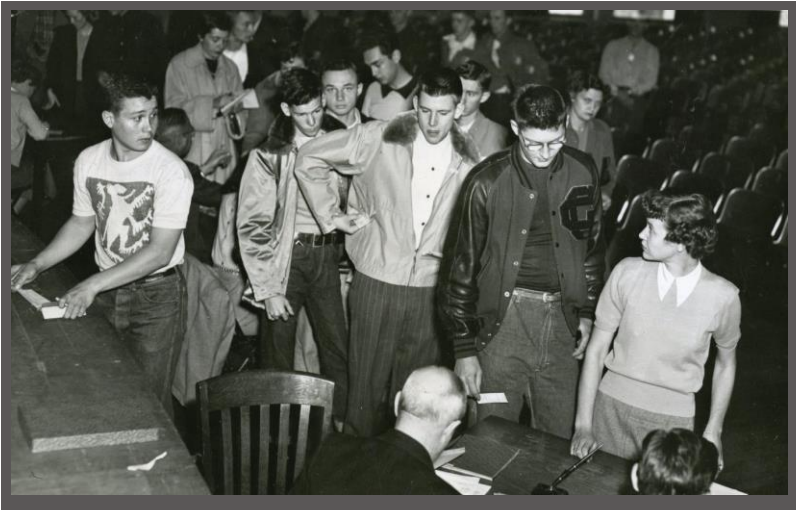
Registration line for courses.