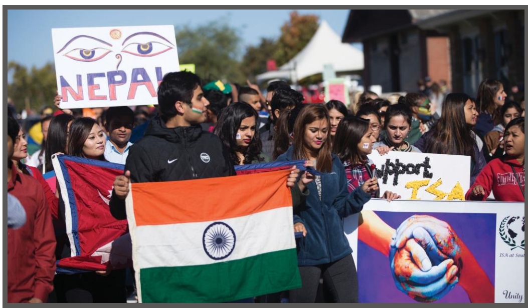
International Students at Southeast Missouri State University