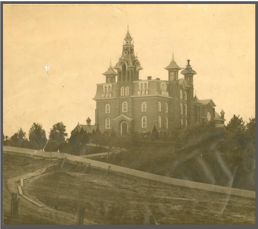
Third District Normal School 1875–1902

There was another college higher up on an airy summit—a bright new edifice, picturesquely and peculiarly towered and pinnacled—a sort of gigantic castles, with the cruets all complete.