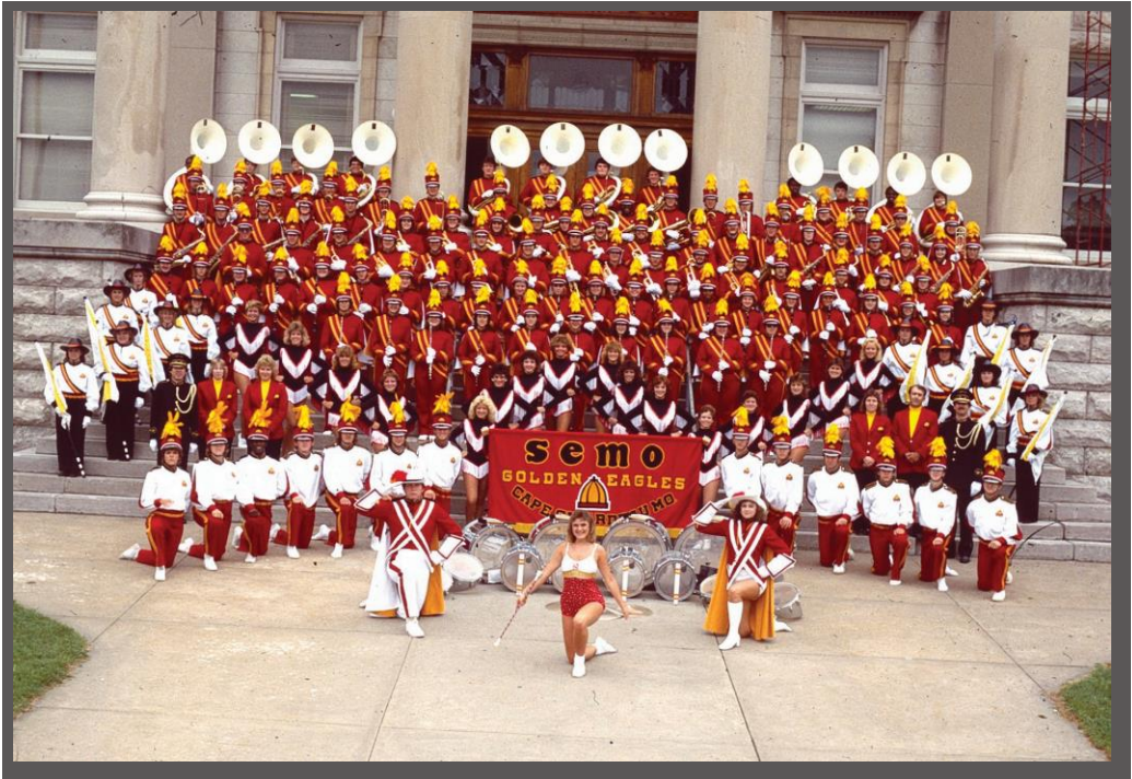
Golden Eagles Marching Band.

So what else did students do for fun? In the 1950s, there was a social life committee for the college, consisting of both students and faculty. The committee set the social calendar for the year, scheduling the Fall Frolic, Sagamore Christmas Ball, Spring Dance, and Saturday night dances. In 1951, campus welcomed the first Greek social organizations—the Delta Kappa fraternity and Sigma Sigma Sigma sorority. By 1960, Southeast housed ten social societies; today there are more than two dozen.