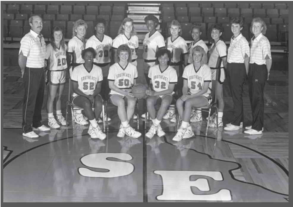
Ohtakians Basketball Team, 1989.